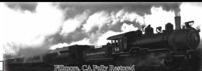
Fillmore, CA Fully Restored

If you would like to be a part of restoring other historic locomotives and railroad rolling stock Contact CaLoco at www.caloco.org. CaLoco is a 501(c)(3) non-profit organization whose goal it is to insure the availability of antique, historical and out of production railroad locomotives for future generations to observe, examine, study and operate.